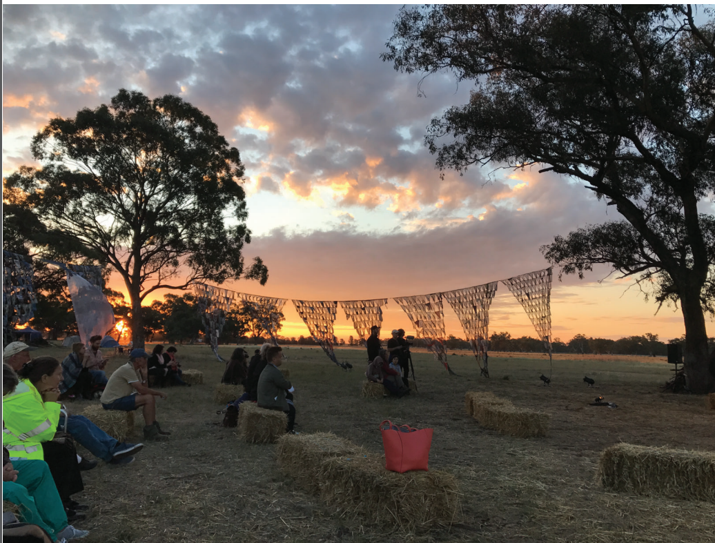
Image: Cad Factory - Shadow Places – Narrandera Travelling Stock Route.

As a planning framework the document provides strategic directions for Council in response to the priorities identified by the Shire's residents during the consultation process. The Plan will assist Council to fulfil its role as a cultural leader, supporting the Shire's Arts and Cultural development, working with organisations and artists, and strengthening the Shire's cultural life.